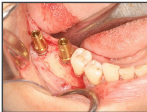
Simultaneous placement and graft